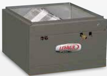
Humiditrol® Dehumidification System

Humidity is harder to control on mild-temperature days, when less cooling is needed. S-Class® units were designed to remove more moisture than many other systems by shifting to a lower-capacity stage on mild days to match the heat load, then running long enough to reduce both temperature and humidity.